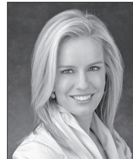
Jennifer Ashton, MD

Congratulations to Board Member Dr. Jennifer Ashton , Ob-Gyn and CBS News Medical Correspondent, for being selected a "Doctor to Watch" in health care journalism. Dr. Ashton is profiled in the current issue of Crain's NewsPro, The Magazine for News Professionals . Follow this link to page 24 to read the article: http://bit.ly/DoctorsToWatch